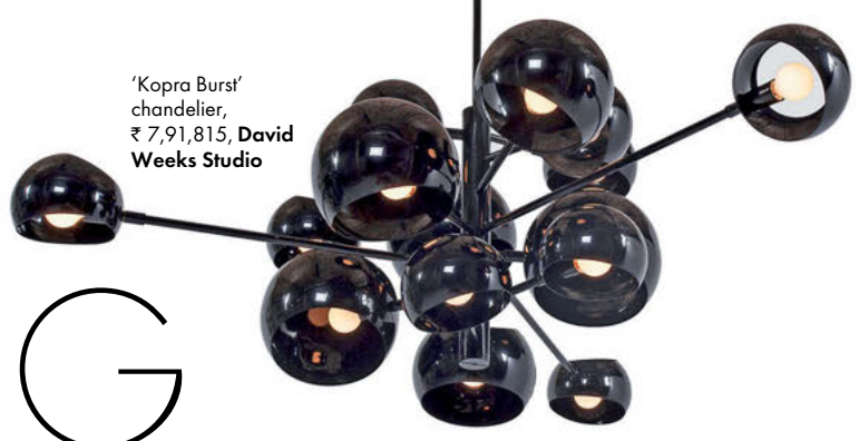
'Kopra Burst' chandelier, ₹ 7,91,815, David Weeks Studio

Postmodern art is all kinds of edgy but how do you work it into your home? We put together moodboards after the experts weighed in