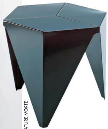
'Prism' tables by Isamu Noguchi, ₹ 32,850, Vitra