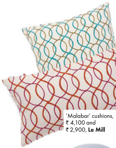
'Malabar' cushions, ₹ 4,100 and ₹ 2,900, Le Mill

Postmodern art is all kinds of edgy but how do you work it into your home? We put together moodboards after the experts weighed in