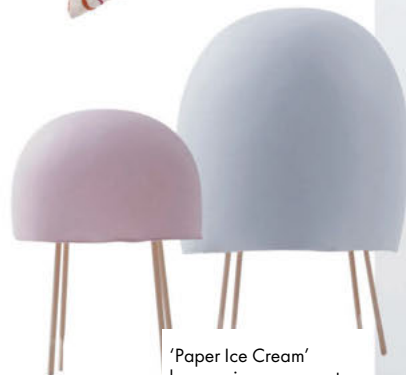
'Paper Ice Cream' lamp, price on request, NICHETTO=NENDO